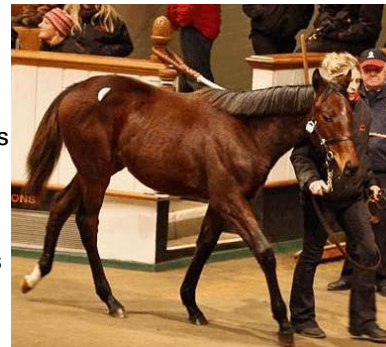
Lot 990 - Galileo colt tattersalls.com