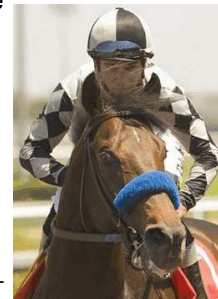
Whatsthescript