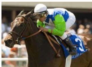
Precious Kitten

When it comes to domination of a single race, a few examples stand out. Woody Stephens' five consecutive wins in the GI Belmont S. and Bob Baffert's seven straight triumphs in the GI Del Mar Futurity are feats unlikely to be achieved again. Bobby Frankel, meanwhile, has been without peer in the GI Matriarch S. and believes Precious Kitten (Catienus) and Visit (GB) (Oasis Dream {GB}) are "very live" to give him his fifth successive Matriarch score Sunday.