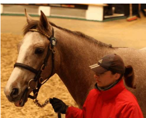
140,000gns Mizzen Mast colt