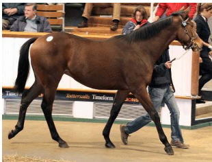
170,000gns Sinndar Topper tattersalls.com

Trade was selective at Tattersalls' one-day Yearling Sale, which kicked off its marathon December Sale in Newmarket yesterday. The clearance rate, a much-beleaguered stat at last week's Goffs November Sale, came in at 55 percent for the 103 lots that changed hands. The 1,997,000gns turnover fell by 49 percent on last year, the 19,388gns average was down by 32 percent and the 8,500gns median dropped by 43 percent. Cont. p2