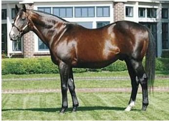
A.P. Indy now at $250,000 lanesend.com

A month after releasing its 2009 stallion fees, Lane's End Farm announced that it has further reduced the fees for many of its stallions. Most notable of the