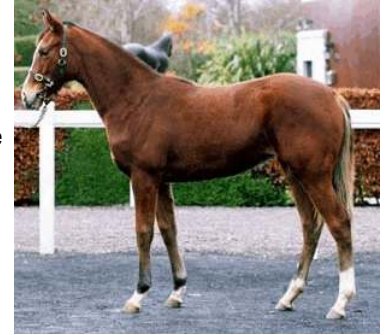
George Washington Filly