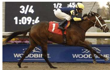
Congor Bay