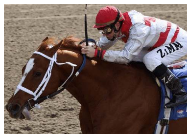
Euroears