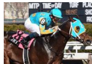
J Be K