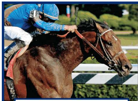
Majestic Warrior is a 2¼ length winner of the Hopeful S.-Gr.1.