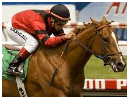
Backbackbackgone Benoit photo

A field of six will line up for Sunday's GIII Hollywood Prevue S., including undefeated ☆ "TDN Rising Star" ☆ Backbackbackgone (Put It Back) and MGSW