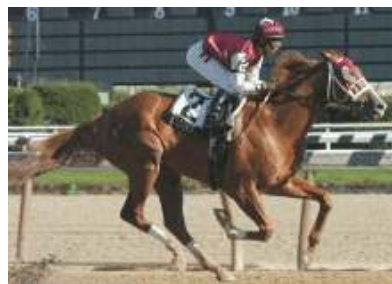
Etched winning the Gill Nashua