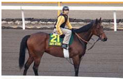
Rahy's Attorney

A full field is expected for Japan's top race over the metric mile, and the $2-million feature has attracted a single foreign invader, G1 Woodbine Mile hero Rahy's Attorney (Crown Attorney). The four-year-old arrived in Japan Nov. 11 following a 24-hour journey from his Woodbine base and seems to have taken the trip in stride. "His condition has not changed since he was