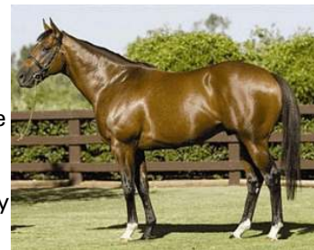
Oratorio, sire of Wednesday's topper