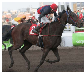
Jockey Club del Peru

Lady Shatzi, an impressive winner of the Group 1 Clasico Enrique Ayulo Pardo (Peruvian Oaks) October 12, rallied home to her second classic victory to defeat