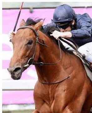
Duke of Marmalade