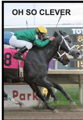
OH SO CLEVER

All horses in the TDN are bred in North America, unless otherwise indicated