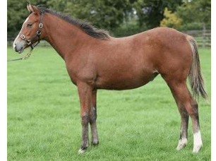
George Washington filly