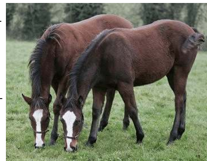
Twin Foals, hips 486 & 487 www.goffs.com

Further interest in Goffs November will be generated when the first set of twin foals ever catalogued by the Co. Kildare auction house go under the hammer. Offered as Hips 486 and 487 by Drummond House Stables, the pair of Orpen colts are out of the winning mare Fancied (GB) (Dominion {GB}), and are half-brothers to three winners. In addition to George Washington's sole representative, first-season sires with stock available include the Coolmore quintet Hurricane Run (Ire), Holy Roman Emperor (Ire), Ad Valorem,