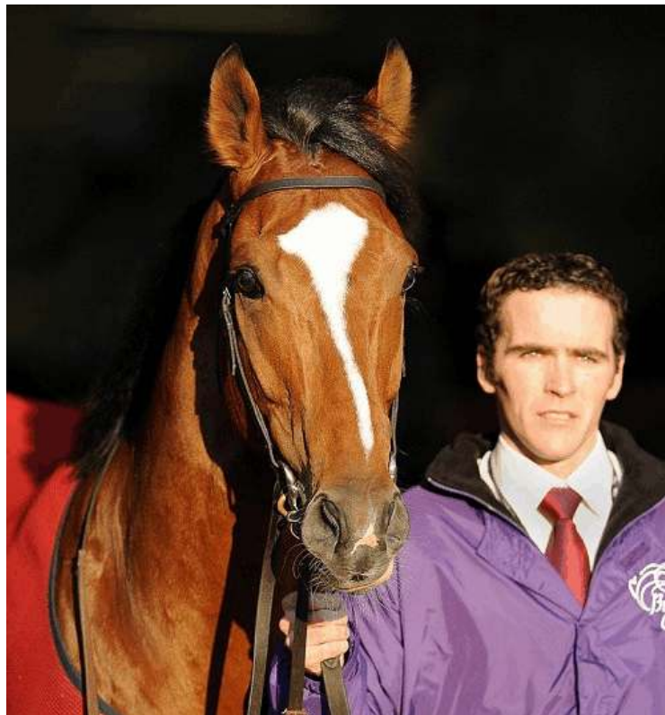
George Washington (2003-2007)

Devoted to the horse. Dedicated to our clients. 3225 Old Frankfort Pike Lexington, Kentucky 40510 (859) 254-0424 www.darbydan.com