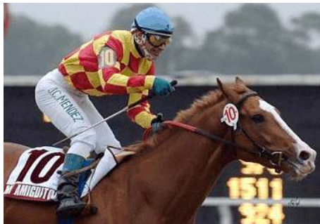
Mi Amiguito

Mi Amiguito (Arg) (Indygo Shiner), winner of the G1 Argentine 2000 Guineas, and second jewel hero City Banker (Arg) (Lode), will likely vie for favoritism at Hipodromo Argentino de Palermo in Saturday's G1 Gran Premio Nacional-Copa Secretaria de Turismo de la Nacion-Giovanni Di Firenze (Argentine Derby), the final leg of the Argentine Triple Crown. The 2500-meter event will anchor a 19-race card at Palermo, which will include three other Group 1 stakes Saturday. Jockey Frankie Dettori will make the trip to Argentina to compete. "I am excited and looking forward to riding in a