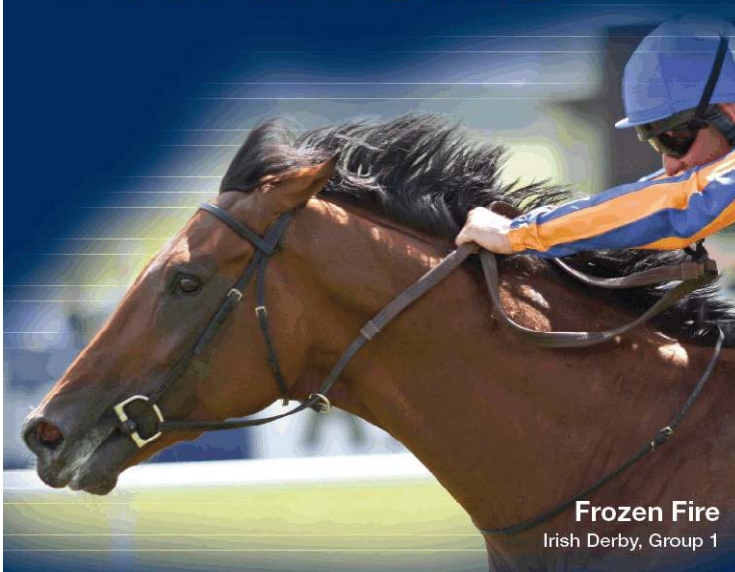
Frozen Fire Irish Derby, Group 1