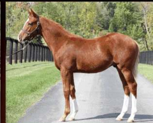
Colt O/O ROYAL PRIZE by Kingmambo Consigned by Hill 'n' Dale