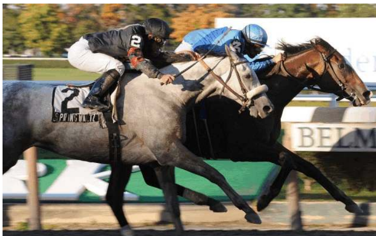
Altesse edges Spring Waltz