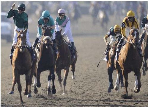
Raven's Pass (left) in the Classic

Trainer John Gosden, who enjoyed a huge Breeders' Cup with two winners, visited the quarantine barn at Santa Anita Park Sunday morning to take a look at his stable stars. The veteran trainer walked Breeders' Cup Juvenile Turf hero Donativum (GB) (Cadeaux Genereux {GB}) for awhile and watched as GI Breeders' Cup Classic upsetter Raven's Pass (Elusive Quality) was photo-