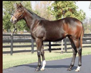
Filly O/O WITCHFUL SAINT by Saint Ballado Consigned by Moonestone Sales

With three defeats in France on his resume, including a latest fifth in the Oct. 4 G1 Prix du Cadran, Yeats finally broke the hoodoo under an enterprising ride from Johnny Murtagh here. Despite boasting wins every time he set foot in Britain, including in the last three renewals of the G1 Gold Cup at Royal Ascot, the dark bay's illustrious career had lacked a victory on his forays to these shores.