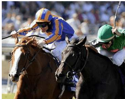
Maram (right)