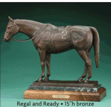
Regal and Ready • 15" h bronze