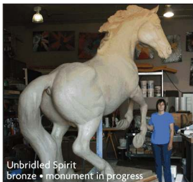
Unbridled Spirit bronze • monument in progress

PEDIGREE INSIGHTS... Get pedigree expert Andrew Caulfield's take on racing's newsmakers! You can find all of Caulfield's columns in the TDN Archive .