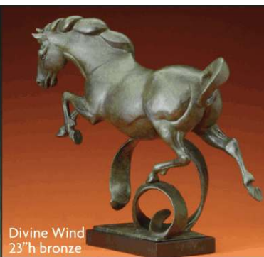
Divine Wind 23" h bronze