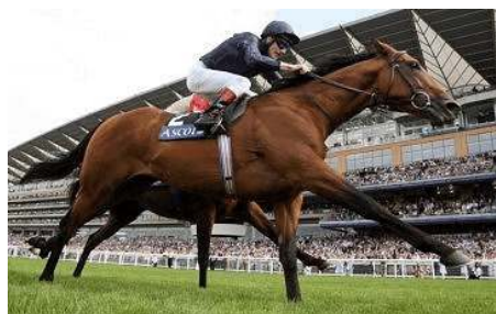
Duke of Marmalade

Johnny Murtagh is set to maintain his partnership with Duke of Marmalade (Ire) (Danehill) in the GI Breeders' Cup Classic at Santa Anita next Saturday. Trainer Aidan O'Brien, who outlined running plans yesterday,