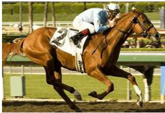
Casino Drive

GI Santa Anita H. over the former synthetic surface at the Great Race Place. He heads to the Classic off a win in Del Mar's GI Pacific Classic in late August.