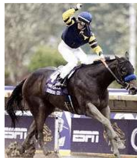
Indian Blessing

base of late. Ginger Punch has annexed three Grade I's since last year's Distaff tally, but will have to lock horns with the unbeaten Zenyatta (Street Cry {Ire}), who got the best of her in Oaklawn's GI Apple Blossom H. in April. Champion Indian Blessing (Indian Charlie), winner of the 2007 GI Juvenile Fillies, will contest the Filly & Mare Sprint. She has also been pre-entered in the Sprint. Two previous GI Turf winners, Better Talk Now (Talkin Man) (2004) and Red Rocks (Galileo {Ire}) (2006), will seek their second Breeders' Cup score.