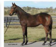
Hip 791 Pete's Fancy colt Half to 2008 G2 SW TREES BORRACHOS