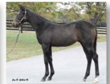
Hip 1484 Greyciousness colt Out of a half-sister to CHIEF SEATTLE