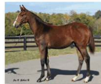
Hip 1941 Mazel Tov filly Out of a young half to GSW MIL KILATES

base of late. Ginger Punch has annexed three Grade I's since last year's Distaff tally, but will have to lock horns with the unbeaten Zenyatta (Street Cry {Ire}), who got the best of her in Oaklawn's GI Apple Blossom H. in April. Champion Indian Blessing (Indian Charlie), winner of the 2007 GI Juvenile Fillies, will contest the Filly & Mare Sprint. She has also been pre-entered in the Sprint. Two previous GI Turf winners, Better Talk Now (Talkin Man) (2004) and Red Rocks (Galileo {Ire}) (2006), will seek their second Breeders' Cup score.