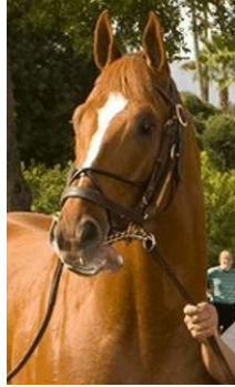
Curlin in Santa Anita's paddock

Dual Classic winner Big Brown (Boundary) might be out, but this year's GI Breeders' Cup Classic at Santa Anita's Oak Tree meeting still offers plenty of intrigue. Reigning Horse of the Year and Classic hero Curlin (Smart Strike) will have to beat two of Aidan O'Brien's best in Duke of Marmalade (Ire) (Danehill) and Henrythenavigator (Kingmambo), both MG1SWs on turf in Europe. Neither colt has raced on an all-weather track before. Undefeated Casino Drive (Mineshaft), winner of the GII Peter Pan S. earlier this spring, was very impressive in his return to the races at Oak Tree Sunday and will try to make history on short rest. Fellow sophomore Colonel John (Tiznow) has thrived on the synthetic surfaces in Southern California and makes his first start since his thrilling victory in the GI Travers S. in August. Go Between (Point Given) has really found his calling since trying synthetic surfaces. The chestnut won the Sunshine Millions Classic and finished second in the