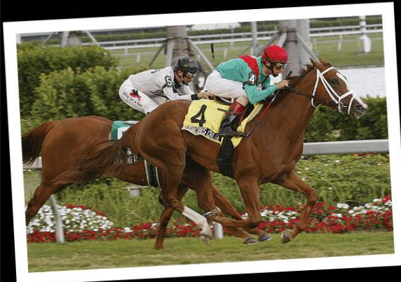
In her 3yo debut, AUDACIOUS CHLOE defeated Champion 2yo Dreaming of Anna winning the Gaily Gaily S. at Gulfstream.