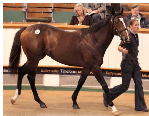
Lot 1040 - Compton Place colt tattersalls.com

Demi O'Byrne was also in action, going to 160,000gns to outbid agent Stephen Hillen for lot 1040, a pinhooked Compton Place (GB) colt. The bay was offered from Ciaran 'Flash' Conroy's Co Tipperary-based Glenvale Stud, which bought the youngster for €46,000 as a foal.