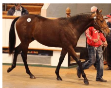
Lot 1041 - Marju colt