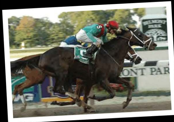
Determined winner of Belmont's Beldame-G1, UNBRIDLED BELLE defeated major winners INDIAN VALE and GINGER PUNCH.