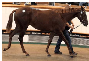
Lot 967 - El Corredor filly tattersalls.com