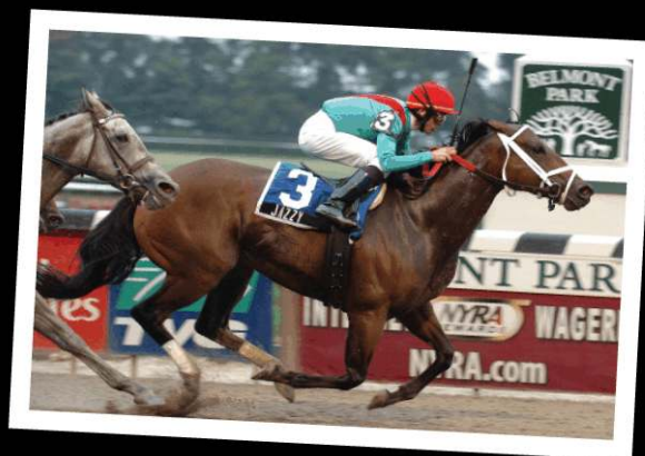
After posting her first U.S. stakes win on Turf at Saratoga, JAZZY won the Gallant Bloom-G2 on Dirt in her next start.