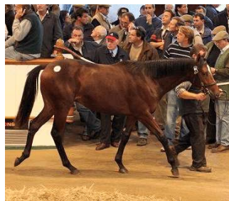
Lot 841 www.tattersalls.com

Shadwell Estate Company dominated the top end trade in Newmarket yesterday for the opening session of Book 2 of Tattersalls' October Yearling Sale. Ferguson, Shadwell and Maktoum offshoot Rabbah Bloodstock spent a total of 2,107,000gns, 34.8 percent of the entire days' turnover, and accounted for seven of the eight six-figure lots. A