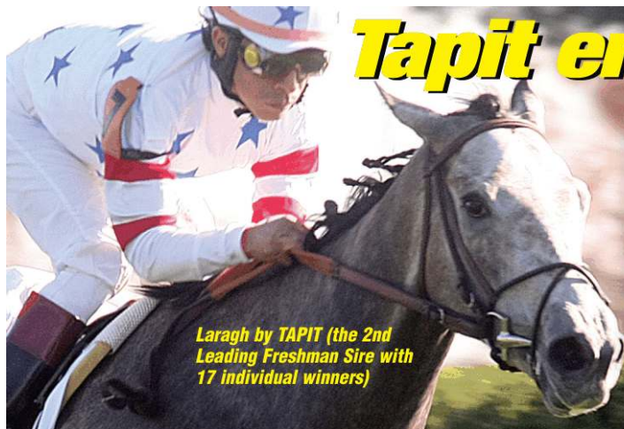
Laragh by TAPIT (the 2nd Leading Freshman Sire with 17 individual winners)