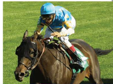
HIP #422 MUSHKA

These ladies know their way to the Winner's Circle.