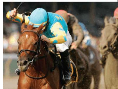
HIP #562 BARONESS THATCHER

These ladies know their way to the Winner's Circle.