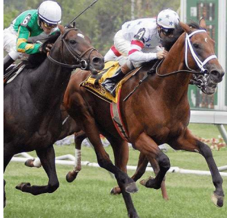
Big Brown in His Final Start