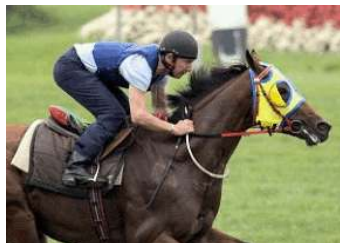
Archipenko Four Footed Foto