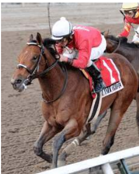
Run Away and Hide