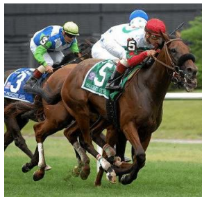
Backseat Rhythm