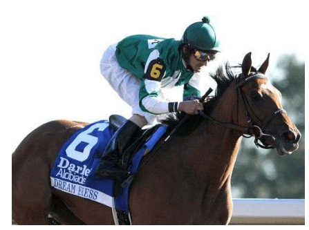
Bernstein's Dream Empress to become her sire's

Mares capable of producing four graded/group winners are all too hard to come by, but La Affirmed--a three-parts sister to the champion juvenile filly Outstandingly--achieved that notable feat, with considerable help from Storm Cat. Coincidentally, La Affirmed