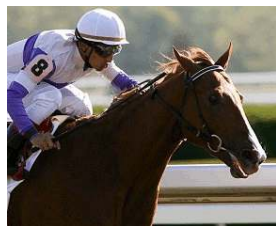
Square Eddie EquiSport

A trio of juveniles stepped up with prime-time performances as graded stakes went off at a rapid pace in the U.S. yesterday. Square Eddie (Smart Strike), a European import making his U.S. bow in the GI Lane's End Breeders' Futurity at