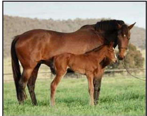
A full sister to Australian champion WEEKEND HUSSLER (AUS) (Hussonet--Weekend Beauty {Aus}, by Helissio {Fr}) was born at Arrowfield Wednesday.

Oct. 4, 1989... Secretariat was euthanized at Claiborne Farm in Paris, Kentucky due to complications from laminitis. He was 19.