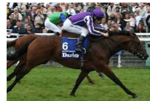
Bushranger (Ire)