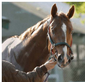
Casino Drive at Belmont