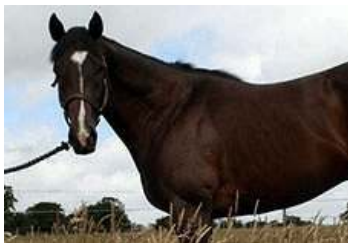
Flashmans Paper (GB) www.johnbestracing.com

Also making the trip is Flashmans Paper (GB) (Exceed and Excel {Aus}), who got off the mark in his third career start when taking the Listed Windsor Castle S. at Royal Ascot June 17. The runner-up that day--beaten a half length--was subsequent Group I stakes winner Bushranger (Ire) (Danetime), who is set to contest today's Shadwell G1 Middle Park S. at Newmarket. The British gelding finished fifth in his