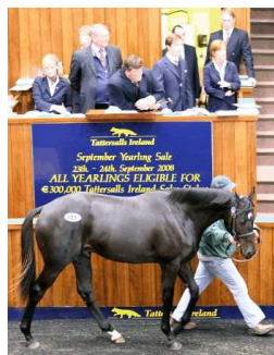
Lot 151