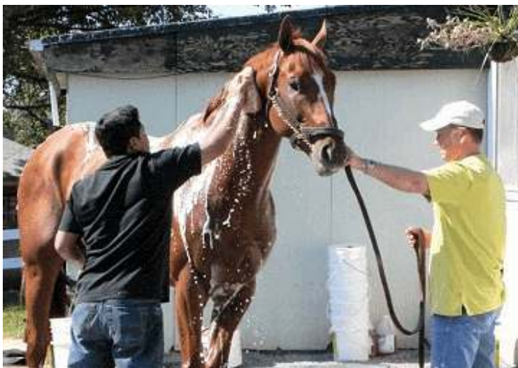
Curlin gets a bath yesterday after arriving at Belmont