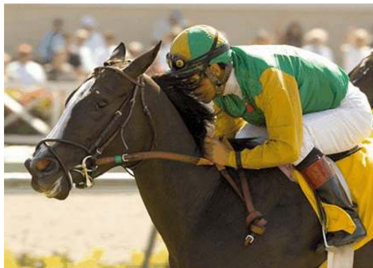
Queen ofthe Catsle Takes Div. 2 of the Daisycutter