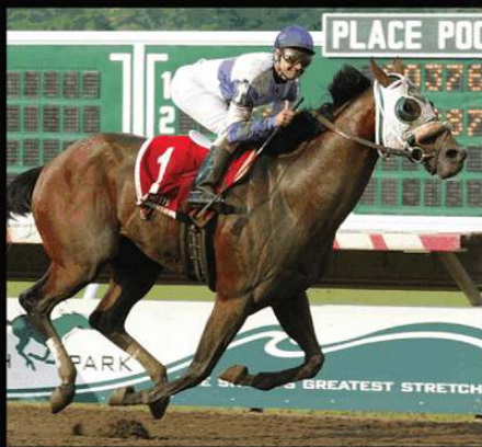
Eaton Keeneland September Sale graduates include