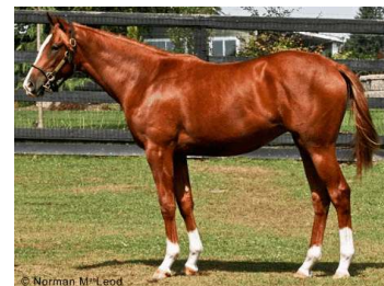
Hip 52, $50,000 City Zip filly