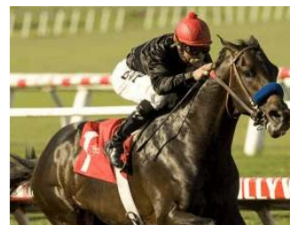
Two Step Salsa

A competitive field of 14, including Southern California-based MGSW Two Step Salsa (Petionville), was entered for Monday's $1-million GII Pennsylvania Derby at Philly Park. The GIII Affirmed H. winner has been assigned the nine slot. You and I Forever (A.P. Indy), a close second behind subsequent GI Travers S. runner-up Mambo in Seattle (Kingmambo) in Saratoga's Henry Walton S. July 27, has drawn widest of all in post 14. Smooth Air (Smooth Jazz), a four-length winner of the GII Ohio Derby last time May 31, will exit from stall six. Field p6