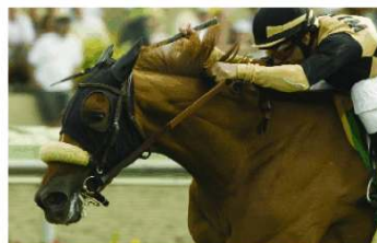
Indian Creek graduate MAGICAL FANTASY , recent winner of Del Mar Oaks-G1 .