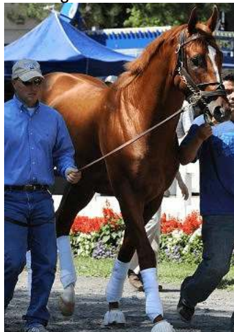
Curlin schooling in the Saratoga paddock

After a slow start due to inclement weather, the Saratoga meeting picked up plenty of steam with a thrilling renewal of the GI Travers S. last weekend, and promises to close with some fireworks with a little help from Horse of the Year Curlin (Smart Strike) in today's GI Woodward S. The G1 Dubai World Cup hero, pegged as the 3-5 morning-line favorite, returns to dirt after suffering his first defeat this season when second-best in his grass debut in the GI Man o'War S. July 12.