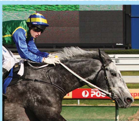
Gr.1 winner Light Fantastic beats Weekend Hussler in the MRC JJ Liston Stakes-Gr.2 at Caulfield recently