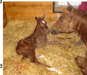
Totebook and Cribnote