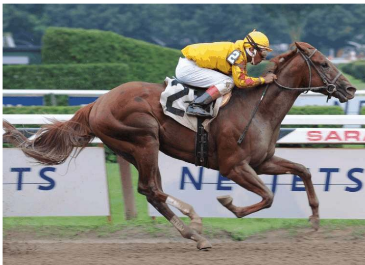
Cribnote at Saratoga