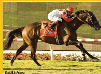
Benoit & Assoc. SPRING HOUSE-G2 $718,284 Denali Keeneland September graduate

In 2007/2008 combined, Denali Sales consignments have produced more Group/Graded stakes winners than all but three much larger consignors.