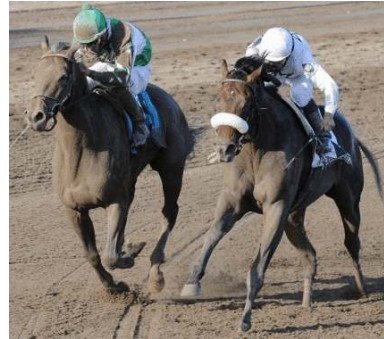
Mambo in Seattle (left) and Colonel John in the Travers