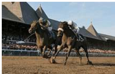
Colonel John (right) gets up in time