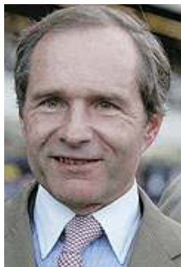
Andre Fabre

In what Andre Fabre described as a "radical change" in his organization, Sheikh Mohammed has acquired Fabre's main yard at Chantilly and will send over 100 horses to the French trainer, he told the TDN's sister publication, Journal de Galop , Friday. With the move, Sheikh Mohammed will become Fabre's main owner, though Fabre will continue to train for five or six of his longtime clients.