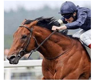
Duke of Marmalade

This week's saga surrounding the lost Ebor meeting has seen a few twists, but New Approach (Ire) (Galileo {Ire}) arrives at Newmarket today in a bid to become the first to win a G1 Juddmonte International having been declared a non-runner for the race. Not shipped from Dublin airport on Tuesday and scratched before the morning inspection was carried out at York, Princess Haya of Jordan's G1 Epsom Derby hero was thrown a lifeline by the transfer of this prize to Suffolk. Injury has kept him off the track since his triumph in the June 7 Blue Riband, and on his comeback he faces his first clash with the older horses, including arguably the best of them in Duke of Marmalade (Ire) (Danehill). "They are very happy with the way he is going at home," jockey Kevin Manning commented. "He's very straightforward and there is no badness in him--he likes to get on with the job and takes a hold of the bridle and is a bit strong. Track-wise, he goes left or right-handed and straight or round a bend, so it's immaterial where the race is, but we didn't want the ground as heavy as it was in York. You've got to respect all the opposition and getting him switched off is the main thing, then we'll take it from there." Cont. p9