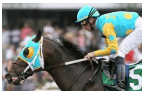
J Be K

low speedsters Gentleman James and J Be K entered. Gentleman James enters off a pair of runner-up efforts behind Golden Spikes in Calder's June 14 Unbridled S. and GII Carry