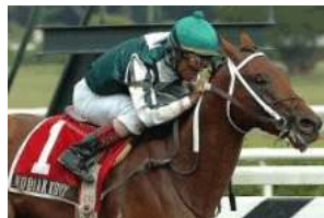
Kodiak Kowboy