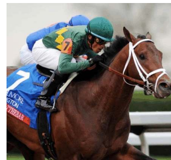
Forest Wildcat's Behindatthebar Horsephotos