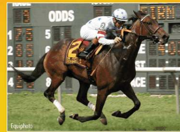
SHARP SUSAN-G2 , $477,926 Denali Keeneland September graduate

In 2008, Denali Stud consignments have already produced 43 stakes horses.