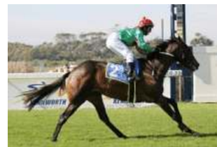
Captain's Lover

Team Valor International's Captain's Lover (SAf) (Captain Al), recently crowned Equus champion three-year-old filly miler in South Africa, will make her European debut in the G3 Prix du Pin, a 1400-meter event to be held at Longchamp Sept. 7. Andre Fabre, who trains the filly in Chantilly, says she had a good six-furlong breeze this week and is happy to start her,