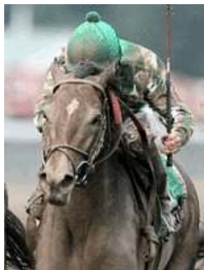
Mambo in Seattle