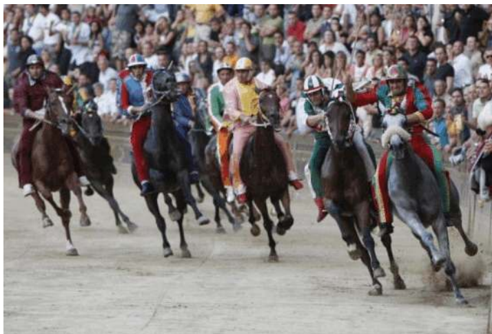
Il Palio, Siena, Italy

All of a sudden, the whole square goes absolutely quiet. It is time for the draw. The loudspeaker announces the first pp and the whole square starts murmuring, oohing, groaning etc...this goes on for all 10 and, finally, they start trying to line up.