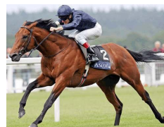
Duke of Marmalade