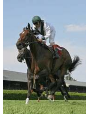
Country Star

COUNTRY STAR (f, 3, Empire Maker--Rings a Chime {GISW, $606,315}, by Metfield), runner-up to recent GII Lake Placid S. winner Backseat Rhythm (El Corredor) in her career bow on the turf at Belmont last September, broke her maiden in style,