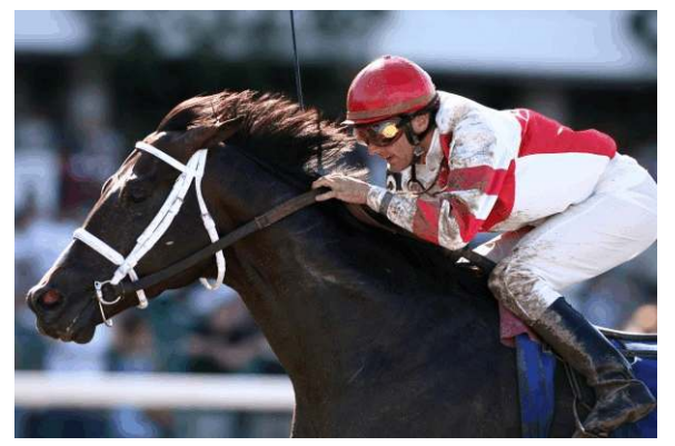
Honest Man takes Iselin Equi-Photo