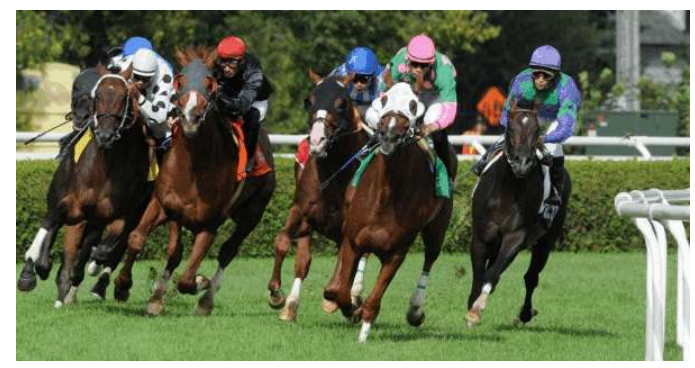
Turning for home in the Sword Dancer

Macho Again fourth-place finishers Tiz Now Tiz Then (Tiznow) and Tale of Ekati (Tale of the Cat), respectively, tuned up for the Travers on the main track vesterday. The former posted five-eighths in 1:03.94, while Tale of Ekati went six panels in 1:13.60.