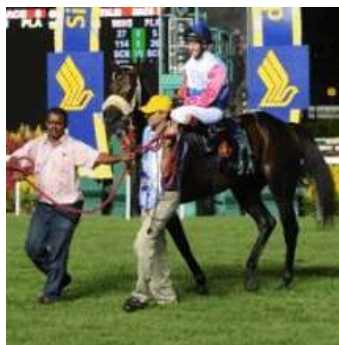
Jay Peg Singapore Turf Club