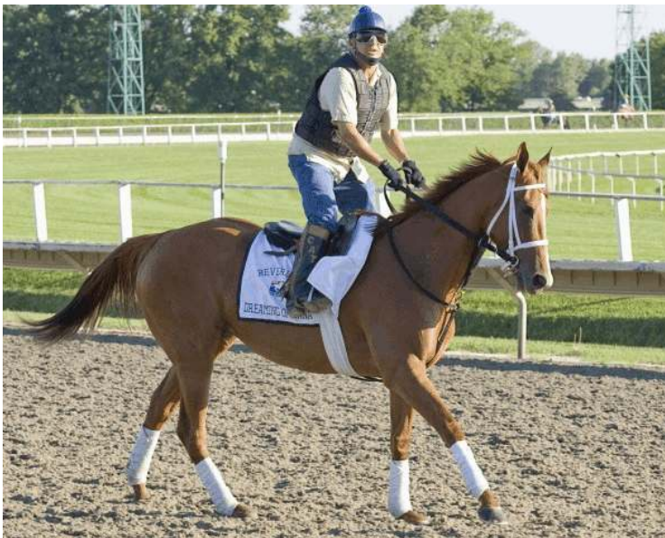
Champion Dreaming of Anna stretches her legs at Arlington Park in advance of Saturday's G1 Beverly D.