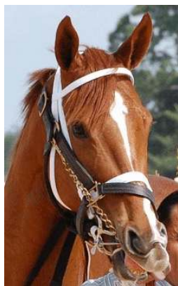
Dreaming of Anna