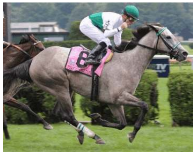
Forever Together