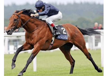
Duke of Marmalade