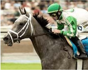
Wait a While

Five-year-old Dynaforce (Dynaformer) has only made eight career starts, she is still looking for her first group/graded success, and she faces a stellar field in the GI Diana S., but she is one to watch today at Saratoga. A Listed winner at Chantilly at three, the bay made just two appearances last year, capturing a conditions event at Vichy in July and running third behind the talented Satwa Queen (Fr) in the G2 Prix Jean