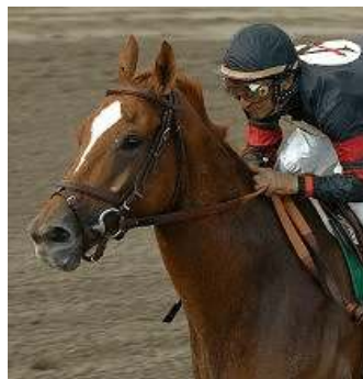
Ginger Punch

Ginger Punch seeks her third consecutive win, and figures to be heavily favored off a 7 3/4-length score in the GI Ogden Phipps H. at Belmont June 14. She'll