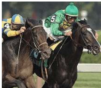
Grasshopper (inside)