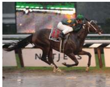
Jardin