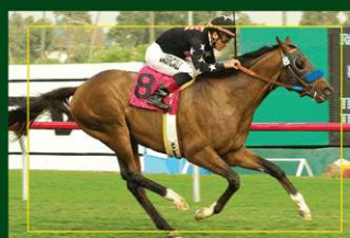
G2 WINNER WARNING ZONE