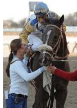
Tale of Ekati