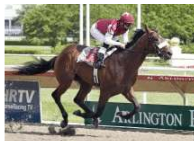
Desert Party Four-Footed Fotos

Darley Stable's Desert Party (Street Cry {Ire}) will try to take this next step towards validating his $2.1-million pricetag from this year's Fasig-Tipton Calder sale in what has become a competitive renewal of the