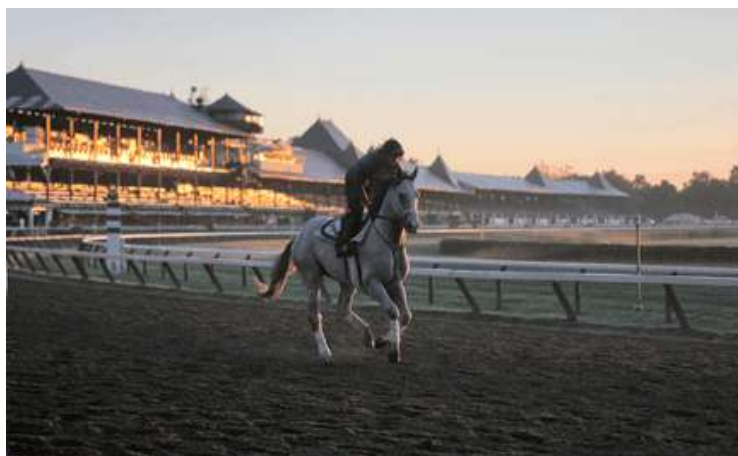
SARATOGA IS COMING ... Opening Day is Wednesday Raceshooters.com