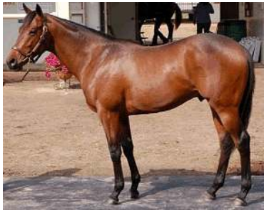
Break Water Edison at OBSMAR