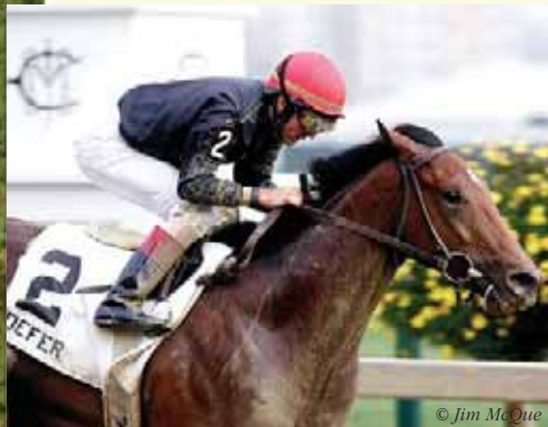
Odgen Mills Phipps' DEFER