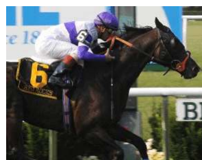
Red Rocks