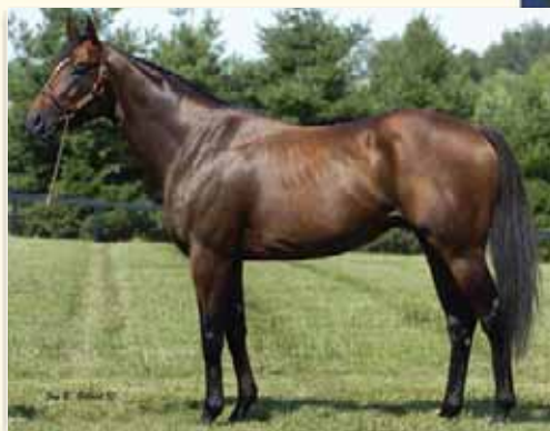
A Mill Ridge Farm Stallion