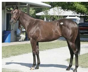
Hip 441

shaped. She looked like she was very quick on her feet. She's the kind of horse that we look for." Hip 441 was bred in Florida by Y-Lo Racing Stables, who acquired Wickedly Wise for $23,000 carrying the Exchange Rate filly in utero. The operation received an immediate return on their investment when they sold the filly to