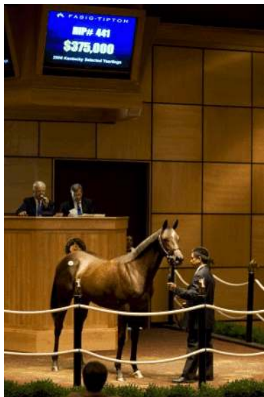
Hip 441