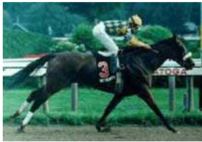
Sky Beauty - 1993

Sky Beauty was bested by 3/4 lengths by Dispute in the GII Bonnie Miss S. in her three-year-old bow, but rebounded to win the Acorn, Mother Goose and CCA Oaks to become the eighth (and last) winner of the Triple Tiara. A gutsy performer with great tactical speed, Sky Beauty hit the wire first 16 times in her first 17 starts, with her lone defeat coming in Hollywood Wildcat's GI