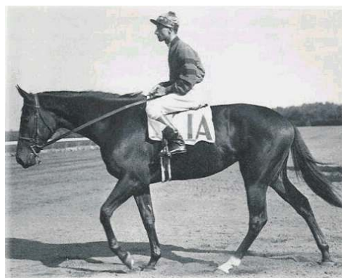
1944 CCA Oaks winner Twilight Tear

Some of the best fillies of all time have won Belmont's G1 Coaching Club of America Oaks, formerly the third leg of New York's Triple Tiara. The list of winners reads like a stakes calendar in New York--Top