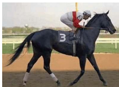
1975 CCA Oaks winner Ruffian

The CCA Oaks, sadly, became the last race that the great Ruffian would finish. The nearly black daughter of