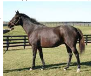
Vera's Joy, dam of $200,000 Successful Appeal colt dapple.net