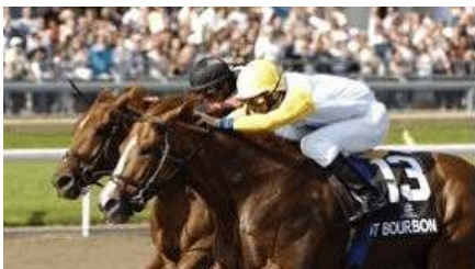
Not Bourbon in Queen's Plate