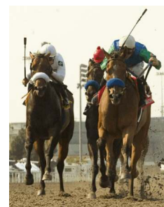
Tres Borrachos (rail) tops Colonel John (left)