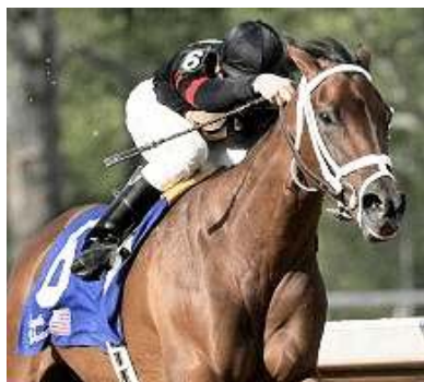
Spun Sugar

8th-PLN, $34,270, Msw, 3yo/up, 5 1/2f, 1:03 1/5, ft. + A CAT NAMED SNIPE (c, 3, Sky Mesa--Irish Cherry {MSW, $147,280}, by Irish Open) had every reason to be good at first asking, given that his relations include half-sister Spun Sugar (Awesome Again), MGISW, $929,171; and half-brother Daaher (Awesome Again), GISW, $455,163. A $200,000 KEESEP yearling in