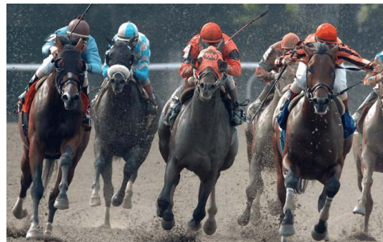
Mint Lane, inside of Pascal and Tizbig

Mint Lane has quietly emerged as a rock-solid performer in the three-year-old division this year, now having won four of seven in 2008, with a pair of runner-up efforts to his credit. He romped in an Aqueduct maiden in