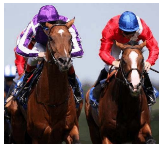
Mount Nelson (left)

Click for the Racing Post chart , brisnet.com PPs or the free brisnet.com catalogue-style pedigree .