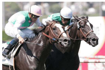
Diamond Diva (inside) tops