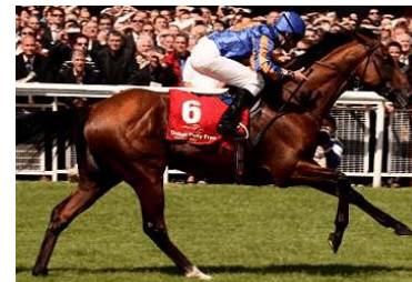
Frozen Fire

Montjeu's considerable impact on the Derby and Irish Derby is made all the more meritorious by the fact that none of his first four crops was sired at a particularly high fee. His three representatives in this year's Irish Derby--Frozen Fire, Alessandro Volta and the Epsom Derby fifth Washington Irving--are the result of €30,000 seasons. This crop also contains the recent French Group 3 winner Montmartre, the Oaks fourth Clowance and several other group performers.