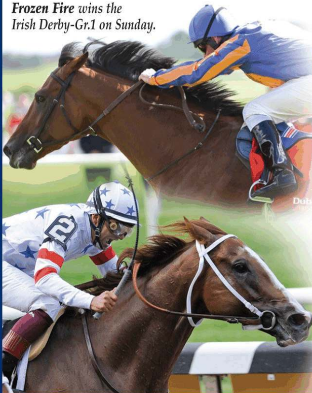
Frozen Fire wins the Irish Derby-Gr.1 on Sunday.

It is going to be fascinating to see whether Frozen Fire can maintain his superiority over his Irish Derby rivals in a trouble-free contest.