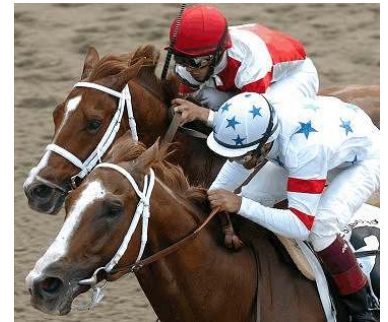
Frost Giant (inside)

The action-packed weekend saw noteworthy achievements on several fronts. For example, the Suburban H. success of Frost Giant made him no less than the eighth son or daughter of Giant's Causeway to win a graded stake at the age of five, and the third to become a Grade I winner at that age. The Hollywood Gold Cup provided Mizzen Mast with his first Grade I winner, with his first-crop son Mast Track, and it was also a great weekend for Juddmonte's Kerali family. Kerali produced seven daughters, and Treat Gently's Group 2 success in the Prix de Malleret means that the first six have now all produced at least one stakes winner, with five hitting the target at group level.