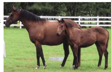
Milanova & Encosta de Lago Filly

The eight-year-old mare Milanova (Aus) (Danehill--L'On Vite, by Secretariat) was expected to be the highlight at Sunday's session of the Inglis Australian Breeding Stock Sale in Newmarket, and she didn't disappoint. The subject of heavy competition from several breeding operations, the bay was finally hammered down to Coolmore Australia for a Southern Hemisphere record A$5 million. She eclipsed the previous mark of A$3.4 million, set by the broodmare prospect Virage de Fortune (Aus) (Anabaa)