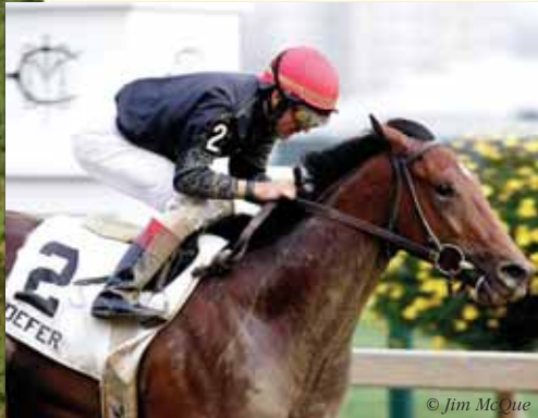
Odgen Mills Phipps' DEFIER