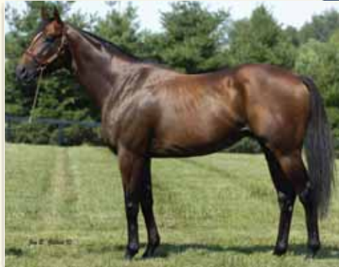
A Mill Ridge Farm Stallion