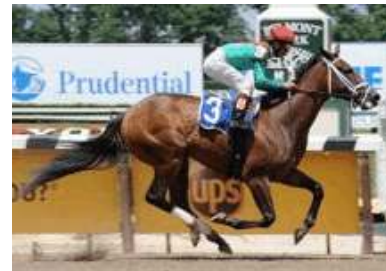
Collegiate

+ COLLEGIATE (f, 2, Saarland--La Sorbonne {Arg} , by Southern Halo ) realized a final bid of $400,000 at last year's Fasig-Tipton Saratoga sale, the highest-priced offering from the first crop of her sire (by Unbridled). The bay filly had not missed a beat in her morning work