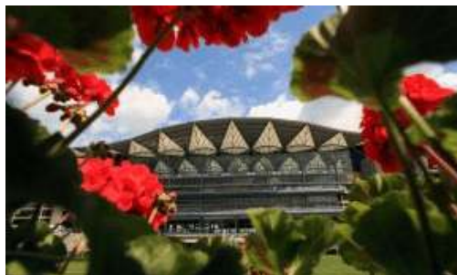
Ascot Monday: The Calm Before the Royal Meeting

Millinery, etiquette, champagne, sunshine and some of the finest Thoroughbreds the world can offer provide the customary blend as Royal Ascot 2008 gets underway today. All the stylizing aside--the track is even staging its own fashion show this year featuring the eccentric displays of Philip Treacy and Vivienne Westwood--it is the track action which provides the focus for racing's purists. As The Duke of Devonshire, Her Majesty the Queen's Representative and Chairman of Ascot Racecourse, outlines in his introduction to the Royal meeting's media guide, this year's renewal will open with three Group 1 races for the first time in its near 300-year history. Some of that rich ancestry is evident in the name of the very race which has changed the face of this year's opener as the King's Stand S. joins the Queen Anne S. and the St James's Palace S. in its newly elevated status. Named after the initiative by King George IV to bring the nation's elite to survey the scene in 1845, the five-furlong dash is the fourth contest to have been promoted to the highest level since 1999. This year, prize money will total £4 million for the first time, none of the 30 races will be worth less than £60,000 and the leading jockey will sport a yellow tour de France-inspired armband as the riders take on a more central role in proceedings.