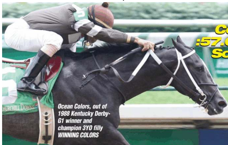
Ocean Colors, out of 1988 Kentucky Derby-G1 winner and champion 3YO filly WINNING COLORS

Orientate 2YO filly, Ocean Colors, scorches to victory in :57.08 at Churchill; now pointed to Schuylerville S.-G3 at Saratoga