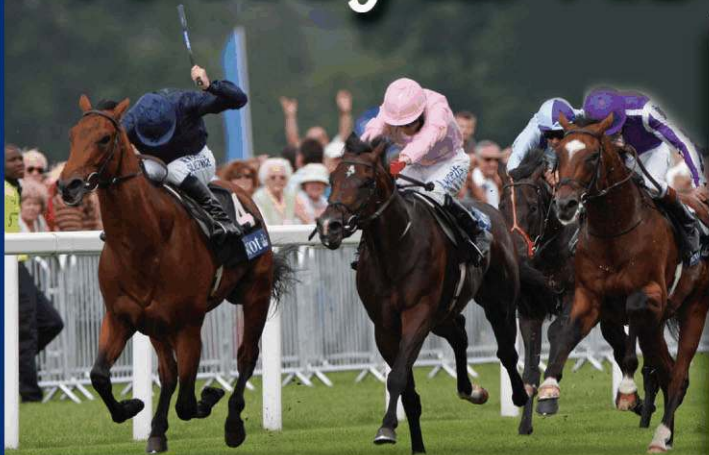
DUKE OF MARMALADE Retires for 2009

A cracking renewal of one of Europe's greatest sire-producing races. Previous winners include top sires KINGMAMBO , GIANT'S CAUSEWAY , ROCK OF GIBRALTAR etc.