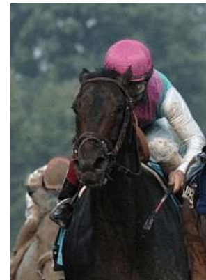
First Defence

Juddmonte's regally bred First Defence (Unbridled's Song--Honest Lady) will try the grass for the first time in Sunday's GIII Jaipur S. at Belmont Park, Daily Racing Form reports. "He's a really nice horse who doesn't want to go a mile on dirt," trainer Bobby Frankel said of the four-year-old, who is coming off a tired fifth-place effort in the GI Met Mile May 26. "You can hold a horse together better on the grass." While First Defence's dam, GI Breeders' Cup Sprint runner-up Honest Lady, only raced on the grass twice, second dam Toussaud was top-class on the sod and produced GI Arlington Million Chester House, GI Secretariat S. winner Chiselling, etc.