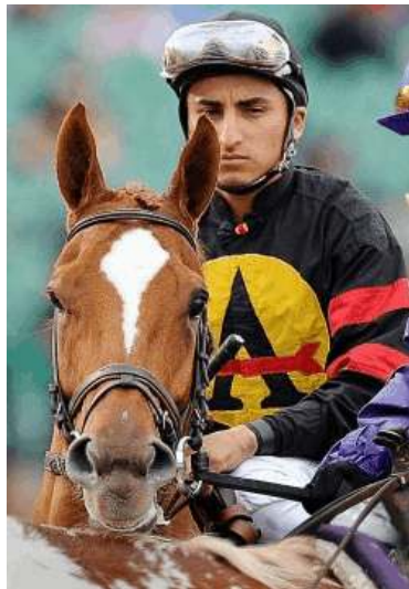
Ginger Punch at the Breeders' Cup

what was essentially a two-horse affair. Ginger Punch more than made amends for the loss, however, earning a divisional championship after capturing four of her next five in 2007, including the GI Go For Wand H., GI Ruffian H. and GI Breeders' Cup Distaff. Ginger Punch picked up right where she left off by annexing the Sunshine Millions Distaff in January and, despite a disappointing third to Zenyatta in the GI Apple Blossom H. in April, showed she's still the best older filly on the East Coast with a driving win in the GI Louisville S.