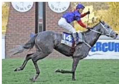
National Colour