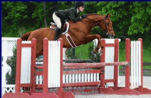
"Buster" was rescued by the TRF from New Holland in 2002.