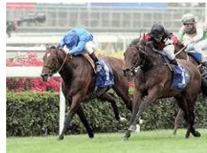
Creachadoir (inside) just misses in the G1 Hong Kong Mile

CREACHADOIR OUT OF QUEEN ANNE, TO MISS REST OF SEASON Godolphin's Creachadoir (Ire) (King's Best) was a shock absentee from the list of contenders going forward for Tuesday's G1 Queen Anne S., with the operation announcing that the four-year-old has sustained a fracture to his off-fore.