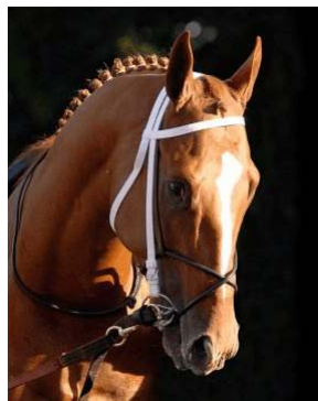
Curlin

return to the races--Saturday's GI Stephen Foster H. at Churchill Downs--but trainer Steve Asmussen said the stiff impost might preclude the four-year-old's participation. "It might eliminate us from running," Asmussen told Daily Racing Form . He added of Churchill Downs, "They may have outsmarted themselves again." Last week, Churchill boosted the purse of the Foster to $1 million, stipulating that a Grade I winner