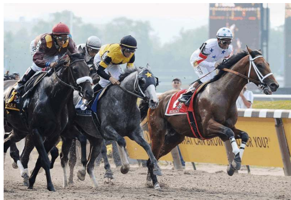
Big Brown (rail) shortly after the Belmont break