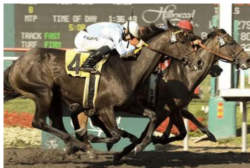
Lethal Heat (middle) beats Tasha's Miracle and Smooth Performer (wide)