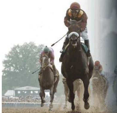
Da'Tara winning the Belmont

Champion Sire TIZNOW , the only horse in the history of the Breeders' Cup to win the classic twice, is the sire of classic Belmont winner Da' Tara .