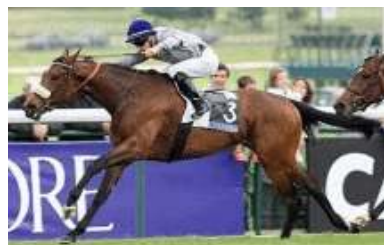
Belle et Celebre