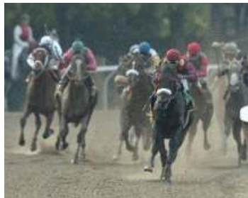
Da' Tara sets sail for home, Denis of Cork (second from left) rallies and Big Brown (far left) calls it a day