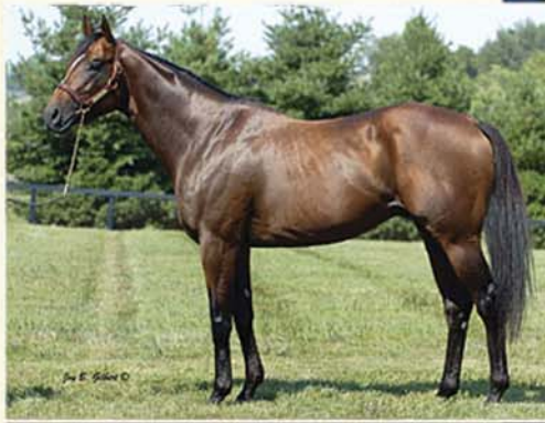
A Mill Ridge Farm Stallion

Forego Stakes-GI Winner of $616,528 by TOUCH GOLD First foals yearlings 2008: $7,500 LFSN