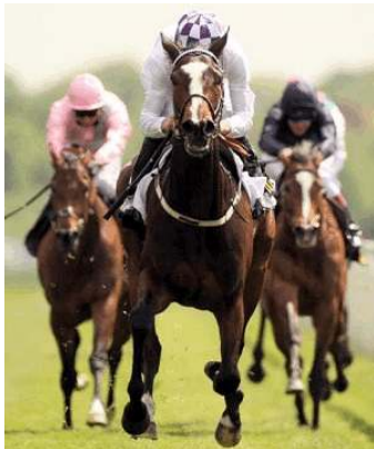
Lush Lashes

Jim and Jackie Bolger's Lush Lashes (GB) (Galileo {Ire}) will be the main focus of attention today as she heads to post for the G1 Juddmonte Oaks at Epsom. She is accustomed to causing a stir, having captured The Curragh's Goffs Fillies' Million on debut and following a fast-finishing sixth in Newmarket's G1 1000 Guineas May 4 with a five-length dismissal of Cape Amber (Ire) (Cape Cross {Ire}) in the G3 Musidora S. at York 10 days later. She bids to become the second filly from Bolger's Coolcullen base to annex this prize after