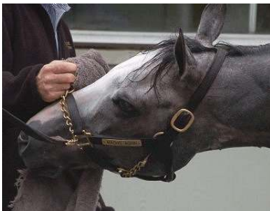
Macho Again enjoying his bath Thursday