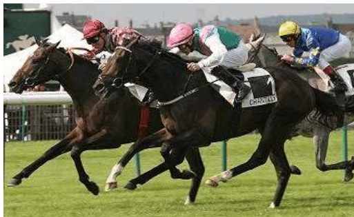
Vision d'Etat (red cap) www.france-galop.com

Vision d'Etat leads Chichicastenango's second crop, which again numbers 36 foals. Three group winners,