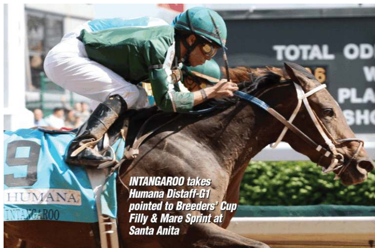
INTANGAROO takes Humana Distaff-G1 pointed to Breeders' Cup Filly & Mare Sprint at Santa Anita