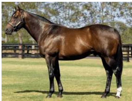
Redoute's Choice arrowfieldstud.com.au

The eight-year-old Zabeel (NZ) mare Zagalia (NZ) realized the day's second-highest price on the Gold Coast, with Magic Millions, agent, purchasing the Group 1 heroine for A$875,000. Strawberry Hill Stud consigned. A full-sister to Group 2-placed Zaria (Aus), Zagalia was produced by December Blossom (Ire) (Condorcet {Fr}), herself a half to group winner Lomond Blossom (Ire) (Lomond). Zagalia enjoyed her best season as a three-