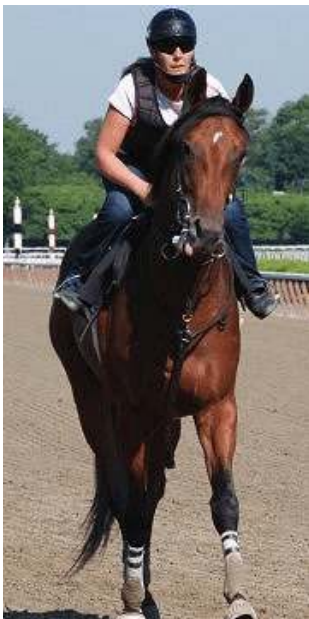
Big Brown Sherackatthetrack