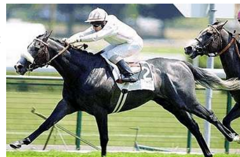
Chichicastenango

The nearest Smadoun came to winning a group race was his 3/4-length second in the G3 Prix Andre Baboin as a four-year-old, and that effort earned him a weight no higher than 106 on the International Classifications.