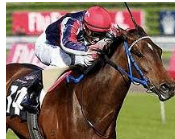
Divine Madonna