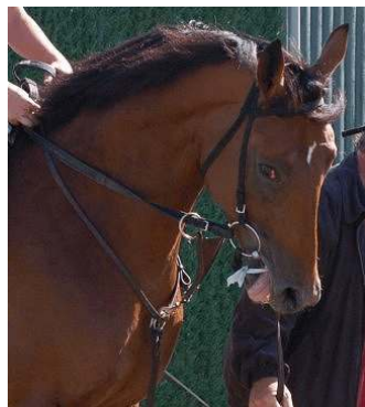
Racing's next Triple Crown winner? Sherackatthetrack

If you were looking for excitement at Belmont Park at 6 a.m. Monday morning, you weren't exactly in the right place. Up until about 8:30 a.m., the most entertaining thing to do on the Belmont backstretch was to watch photographers and camera crews jockey for position along the fence outside of Barn 3, former home to 2003 GI Belmont S. hero Empire Maker and the current digs of Triple Crown hopeful Big Brown (Boundary). Once the 'Big Horse' went under tack, the crowd quickly began to disperse throughout the barn area, searching for new positions. Finally led out by TVG analyst Frank Lyons, Big Brown emerged from the back entrance of Bobby Frankel's barn and made his way toward the paddock tunnel. (Ed. note: Lyons, also a bloodstock agent, recommended the purchase of IEAH's GI Santa Anita Oaks heroine Ariege , et al). After a quick trip through the saddling area, the IEAH Stables' colorbearer made it to the track beneath regular exercise rider Michelle Nevin following the renovation break.