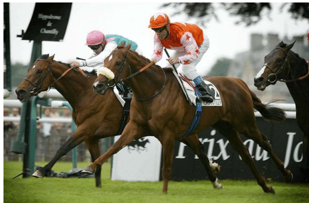
Dr Dino bought €38,000 in Aug '03 by MAB Agency.