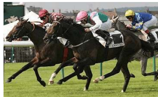
Vision d'Etat (red cap)