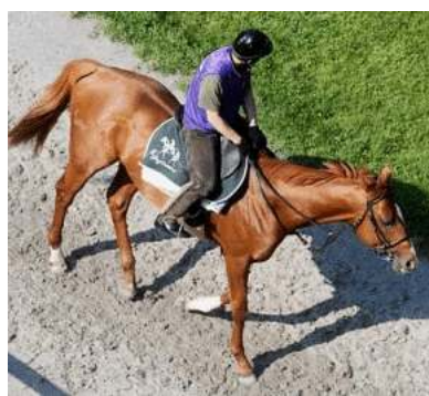
Casino Drive