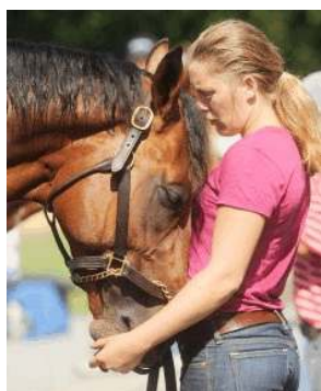
Big Brown Horsephotos