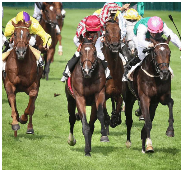
Vision d'Etat sold for €39,000 in Dec 06

Next Yearling Sale : 15-18 August, Deauville