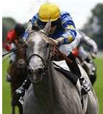
Natagora Paris Turf

The long-running jockey saga surrounding Natagora (Fr) (Divine Light {Jpn}) took another twist yesterday