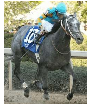
Z Fortune