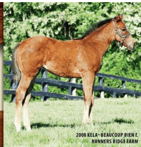
2008 KELA - BEAUCOUP BIEN F. RUNNERS RIDGE FARM