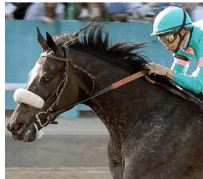
Zenyatta