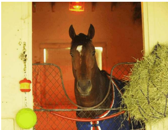
Tomcito at Belmont Horsephotos