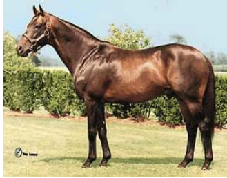
Fit to Fight (1979-2008)