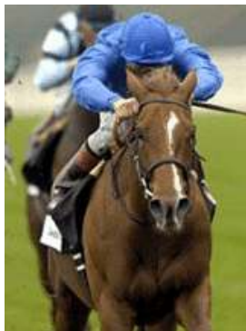
Ibn Khaldun